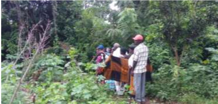
Gender mainstreaming in food and ecosystem management

Promoting community forest management, nature's good that provides healthier ecosystems and safer territories against climate events and enables communities to live in harmony with nature as traditional caretakers.