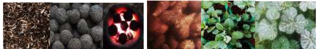
Sustainable waste management and promoting 4Rs

Promoting environmentally friendly solutions to address the negative economic impacts of crises.