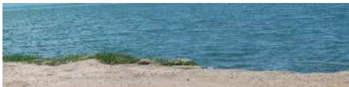
Empowering communities to promote sustainable water management and adaptation to climate change through local actions